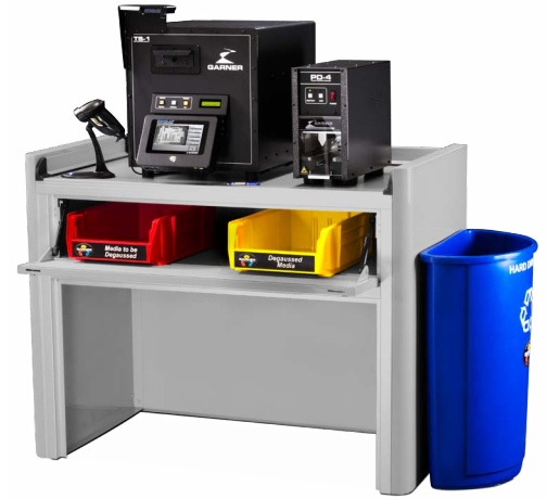
Degauss Destroy Recycle Workstation (DDR-14 IRONCLAD shown)