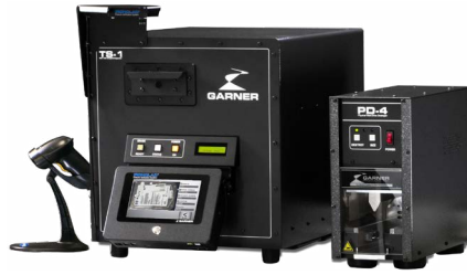
Degauss and Destroy (DD-14 IRONCLAD shown)

Configure a system to match your needs. To ensure data can never be retrieved, pair the PD-4 with our TS-1 NSA-listed degausser, HD-3WXL high-speed degausser, or HD-2X economical degausser.