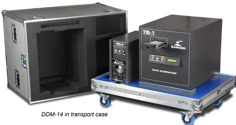
DDM-14 in transport case