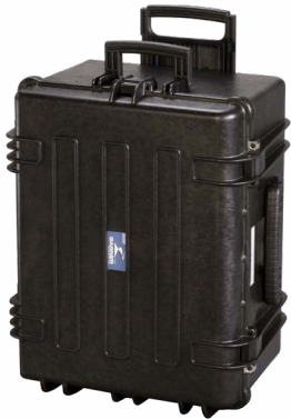
CASE-PD4 MIL SPEC Shipping Case